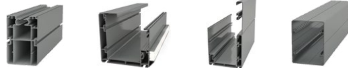
Rails Lighting Gutter (Water-drain) Column